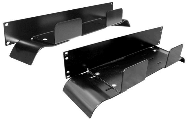
Upper Jumper Tray