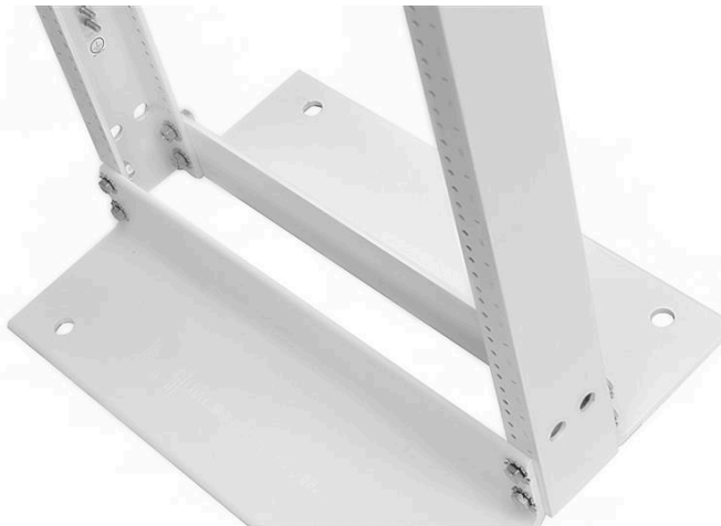
Standard Rack 3"D (80 mm)